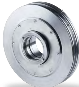
CSR - contacting bushing seal