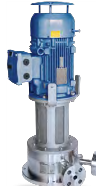
Maximum protection against DGS contamination with process gas