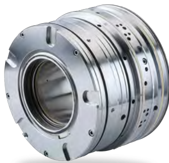
RoTechSeal - maximum robustness against contamination