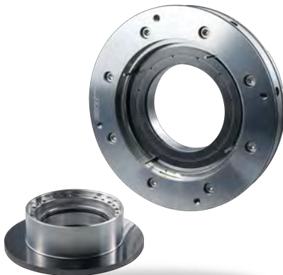
CobaSeal - maximum protection against bearing oil