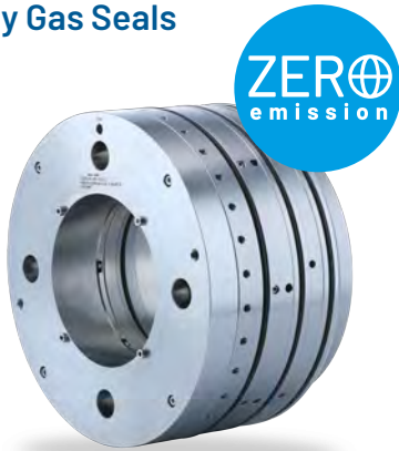
CobaDGS - Zero Emission Solution